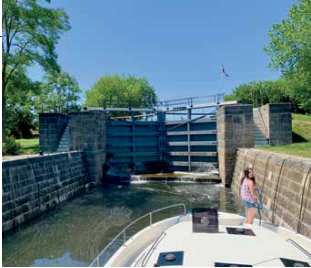
Left to right: Discover the Rideau Canal with Le Boat; Beveridges Locks along Tay River.

THIS TORONTONIAN CAN'T EXPLAIN how she grew up fishing and sailing around Ontario but has never been houseboating or given much thought to the Rideau Canal. Let me atone by saying my prairie-grown husband and urban kids have now seen loons in real life (and not just on golden coins). They can spot great blue herons standing statue-like in the shallows. They will splash about murky lakes even as aquatic weeds tickle their toes and wrap around their calves. They can tolerate nips from mosquitos and deer flies. They can convey that the canal is a UNESCO World Heritage Site because it's the best-preserved example of a slackwater canal in North America, built using European technology without needing extensive excavations.